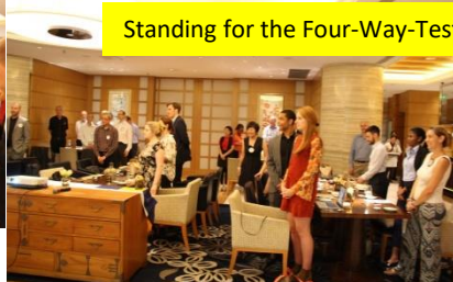
Standing for the Four-Way-Test