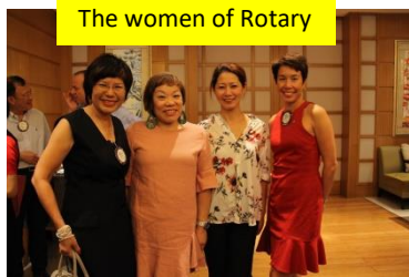
The women of Rotary