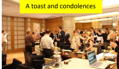
A toast and condolences